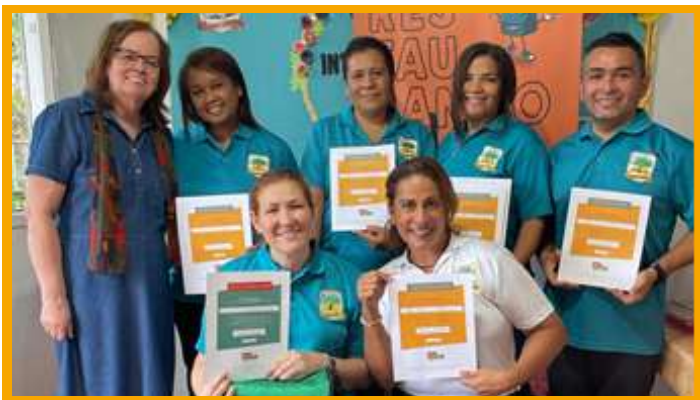
PANAMA – 5 NEW EDUCATORS FROM IGLESIA MISION VISION DISCIPULADO (PANAMA CITY NOVEMBER 2023)