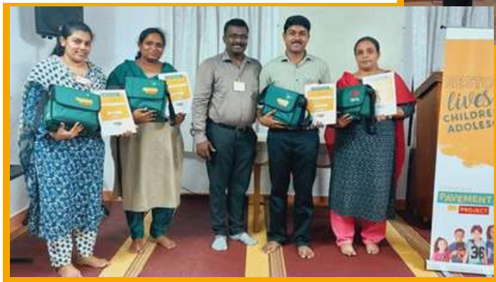
INDIA – LAKKA TTOOR BRETHREN ASSEMBLY, PP NEW EDUCATORS IN KOTTAYAM (MAY 2023)