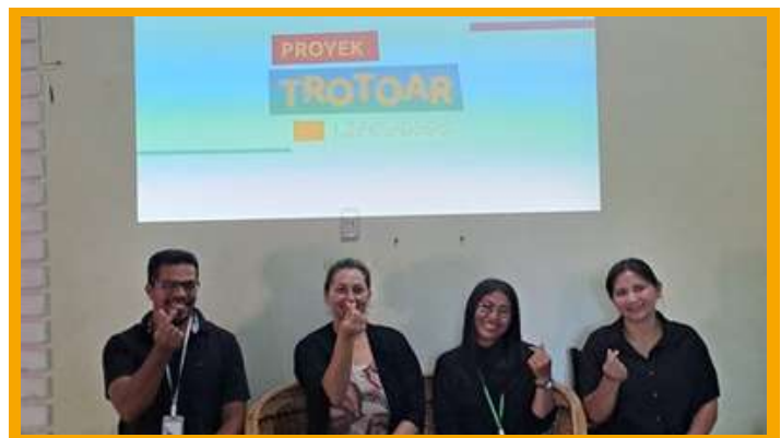
INDONESIA – YD TRAINING CENTER AME (APRIL 2023)