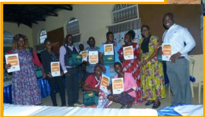
KENYA – PP NEW EDUCATORS FROM BUNGOMA, WESTERN KENYA (AUGUST 2023)