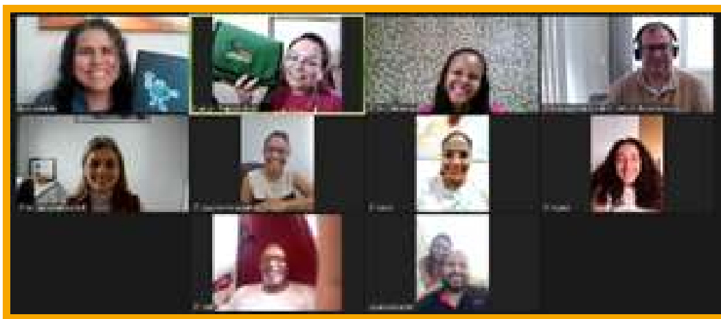
LAT - 10 ONLINE TRAINING SESSIONS WITH EDUCATORS FROM 8 COUNTRIES