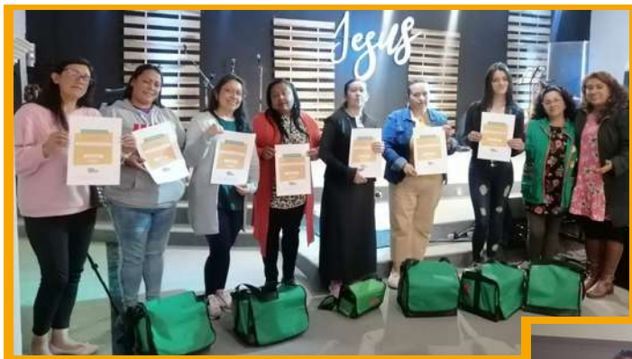
COLOMBIA – NEW EDUCATORS FROM 8 NEW PARTNER ORGANISATIONS (APRIL AND OCTOBER 2023)