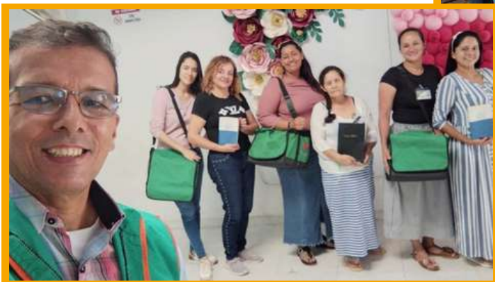
COLOMBIA – PP NEW EDUCATORS FROM IGLESIA CENTRO EVANGELÍSTICO, FUNDACIÓN SEMILLITAS DE AMOR AND CASA V.I.D.A PADRE (MAY 2023)