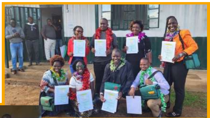
KENYA – AGAPE KITALE PP NEW EDUCATORS (MAY 2023)