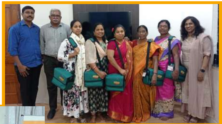
INDIA – IEM PP NEW EDUCATORS IN NAGPUR (OCTOBER 2023)