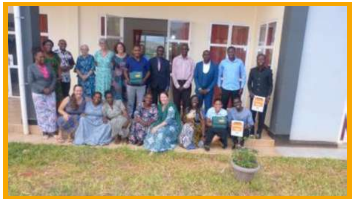
TANZANIA – PP NEW EDUCATORS FROM SAFINA STREET NETWORK, ZUIA TRAFFICKING, AND AGAPE MOROGORO (SEPTEMBER 2023)