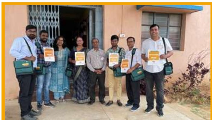
INDIA – ASHRAY PAVEMENT PROJECT NEW EDUCATORS IN JHARKHAND (MARCH 2023)