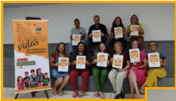
BRAZIL – 13 EDUCATORS FROM MEAP PURUS, PEPE AND JUSTIÇA E MISERICÓRDIA - RIVERSIDE'S AMAZON COMMUNITIES (MAY AND JULY 2023)